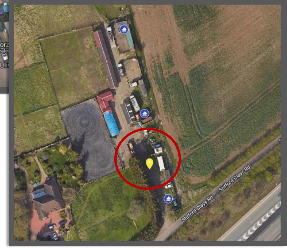
Grays Essex – Container Site