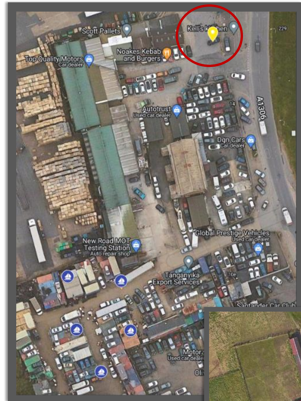
Rainham - Container Export Site